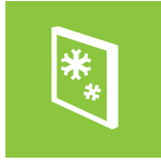
FRP Reefer Liners