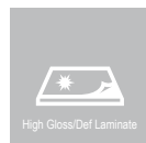
High Gloss/Def Laminate